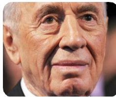
(Shimon Peres, 2012)

"The State of Israel will be measured by the influence it has on poverty and illiteracy in the world... a day will come and this will be the judgment of the Zionist enterprise"