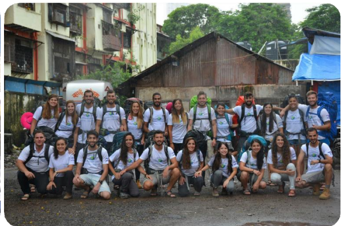
Israeli backpackers together with young people from the Guatemalan Jewish community on a joint volunteer trip, Guatemala city