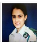
צוות הדר- מקסיקו חבר הדר בת ז"ל 1997-2016 נפלה בפעילות מבצעית בשער שכם -ירושלים