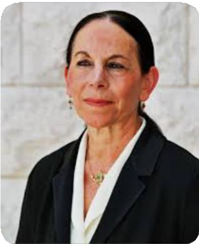
Former Supreme Court justice