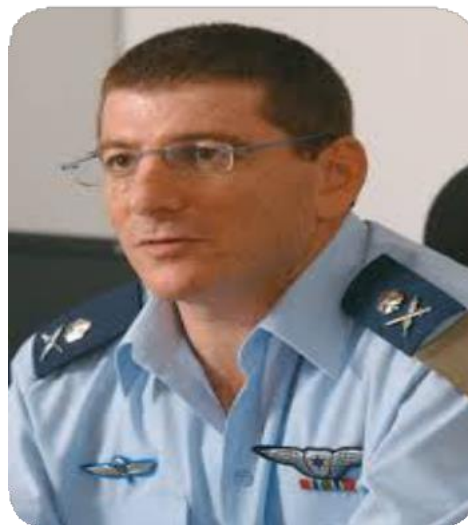
Former israeli air force commander major general (res.)